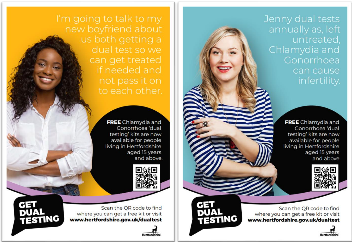
'Get Dual Testing' Posters

A range of dual testing resources are available to promote in pharmacy and in your Healthy Living Zones. 'Get dual testing' posters and images for social media can be downloaded from: www.hertfordshire.gov.uk/dualtestprofessionals printed copies can be requested from: sexualhealthhertfordshire@metrocharity.org.uk