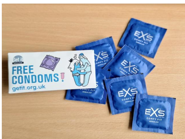
New condom design

Since April 2023, Metro Charity will be overseeing the management of the condom wallet scheme and dual testing on behalf of Hertfordshire County Council and Sexual Health Hertfordshire. To reflect this, a new condom wallet has been designed. The previous blue wallet can still be used (in if date).