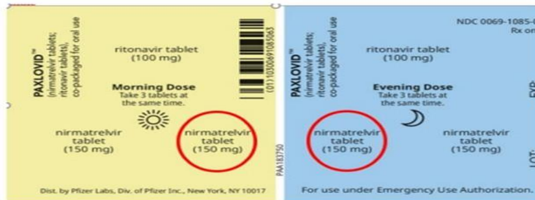
Figure 1: Remove the nirmatrelvir tablets circled in red from the blister card

STEP ONE: Remove one of the 150 mg nirmatrelvir tablets from the morning dose and remove one of the 150 mg nirmatrelvir tablets from the evening dose of the blister card (see figure 1 below). The nirmatrelvir tablets that are removed should be the ones closest to the middle of the blister pack.