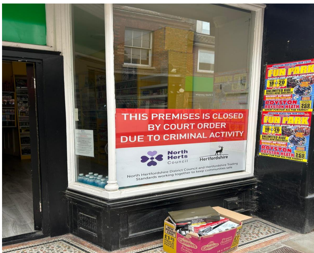
(The front window of Royston Shop & Vape).

As a result of these repeated breaches, North Herts District Council, supported by the evidence of illegal activity obtained by Trading Standards, applied to the magistrates' court for a closure order under the Anti-social Behaviour, Crime & Policing Act. The overwhelming weight of evidence ensured that the order was granted, and the shop has now been closed for a period of three months.